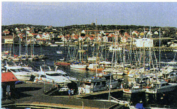
Marstrand, Waterspot Mecca of the Swedish west coast