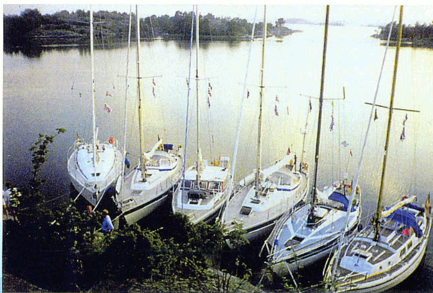
Mittsommernacht in den schwedischen Schären