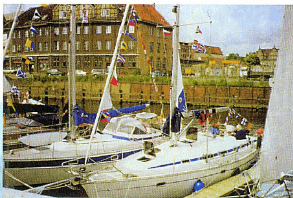
Beim ICCY liegen Sie in der ersten Reihe

During the Gala Evening many nice speeches were held, good music kept us dancing and the evening ended in the early morning hours. It was rather difficult to get up in time for the excu-