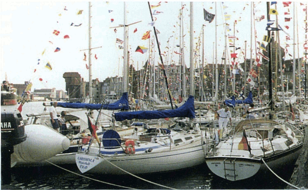
Die 61 Motor- und Segelyachten am historischen Krantor in Danzig